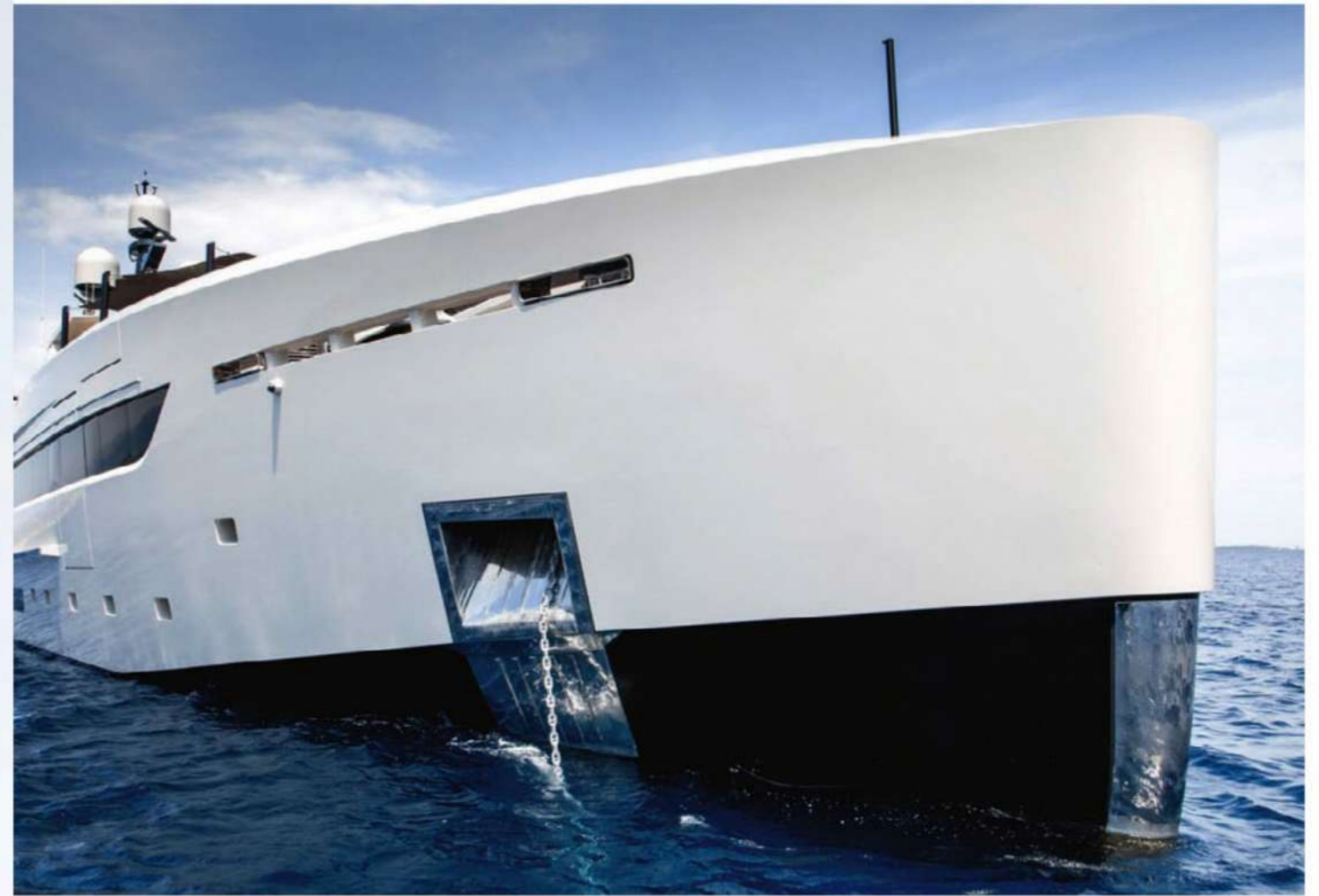
Clockwise from above: the distinctive hull design with its modified plumb bow; the study in the owner's suite; the curved teak staircase starting from the lower deck