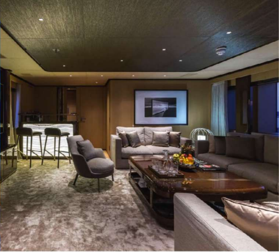
Above: the upper saloon doubles as a cinema and shows how Francesco Paszkowski has used dark polished rosewood to produce