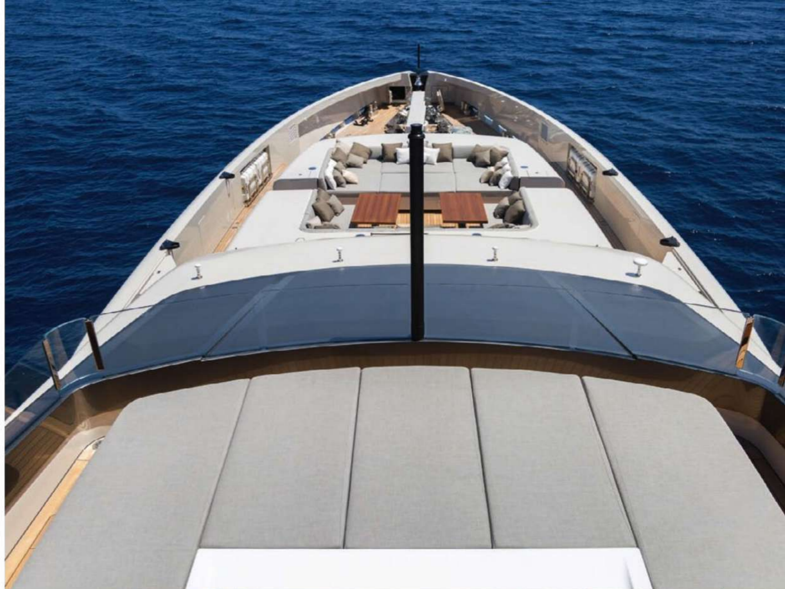
Guests are spoilt for choice when it comes to outdoor spaces on Vertige. Choose from forward on the upper deck, above, or aft on the main deck, right