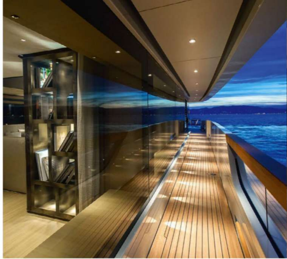
Above: floor to ceiling windows on the main deck help connect the interior to the sea. Below: the aft upper deck is the owner's favourite

The interior, which Paszkowski designed to be under the 500GT threshold to help keep