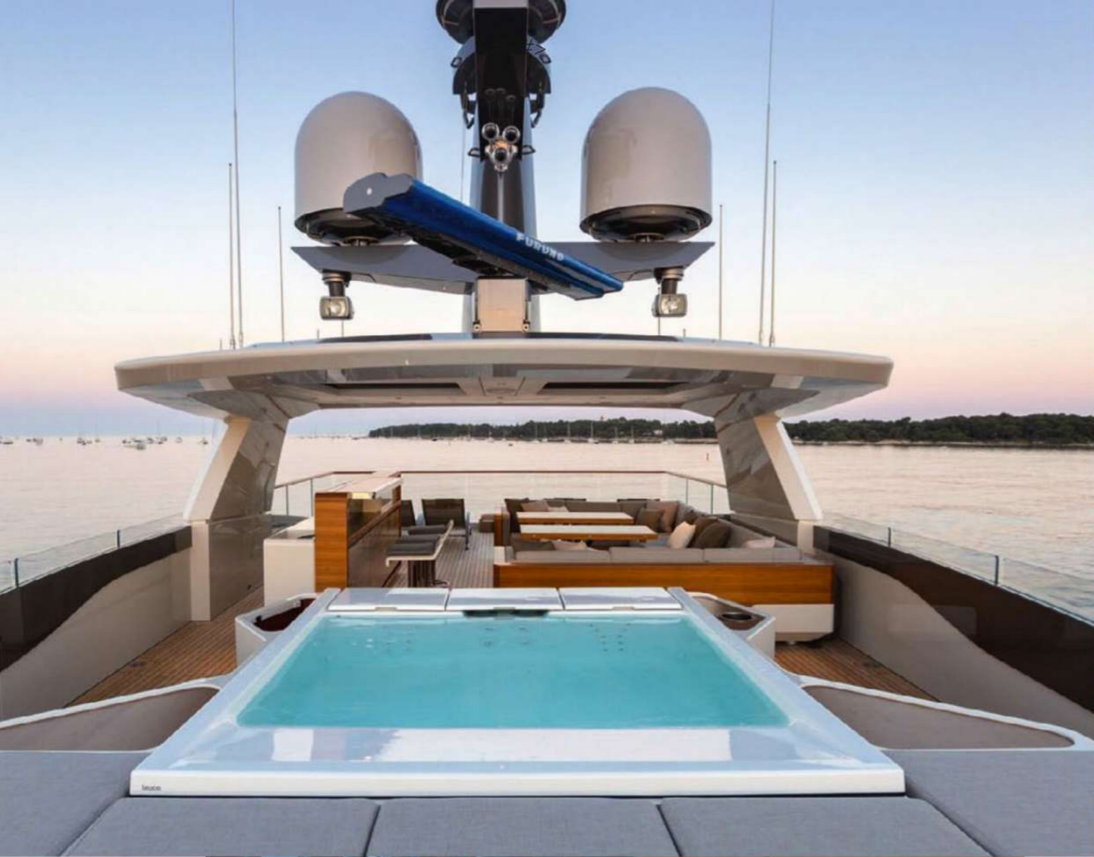
The sundeck is the perfect place for cocktails, says the owner. The spa pool, set forward, is equally refreshing