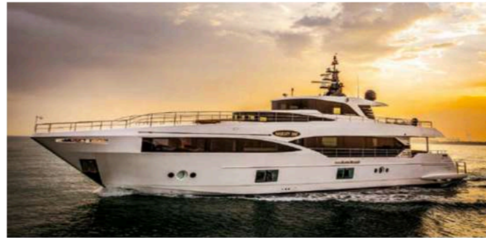
Majesty 100: Gulf Craft is bringing its brand new model to the Med. These 32 metres are intended to wow superyacht novices.