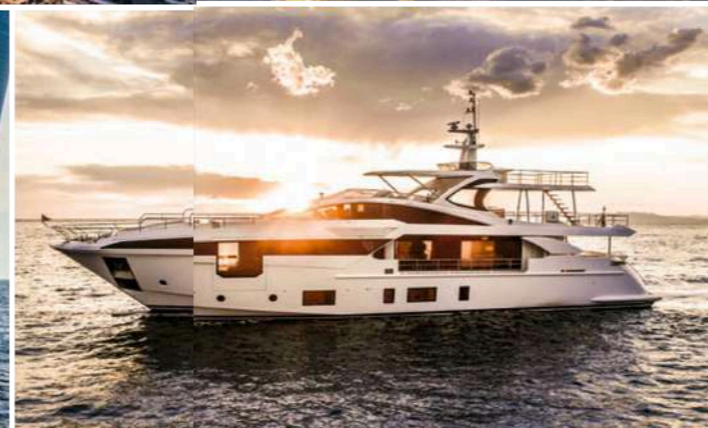
Superb spread: Sanlorenzo-built charter yacht "Seven Sins" (l.) will be docking in Port Hercules – her stern pool section in particular is most impressive. Nautor is bringing its 95 "LOT99", one of the few sailers at the show, and Azimut is exhibiting its new Grande Collection flagship,