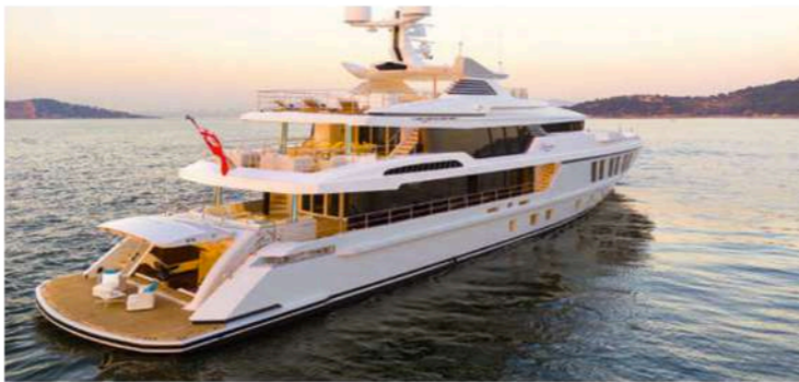
"Razan": Turquoise Yachts from Tuzla will impress quite a few owners with these 47 metres. The interior looks very elegant.