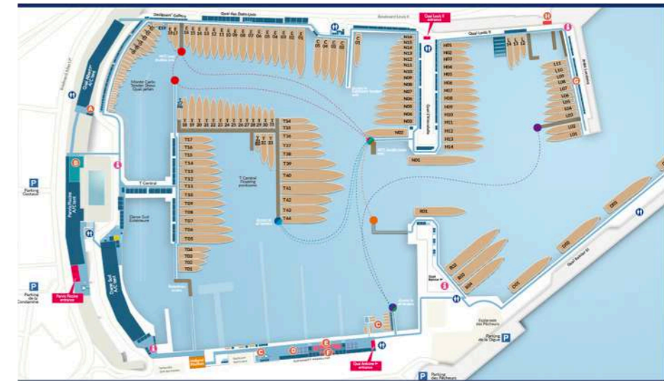
New layout: with construction work now completed, there is once again an exhibitor marquee at Quai Albert 1er. 125 yachts in total are in port, of which 40 are debutantes.