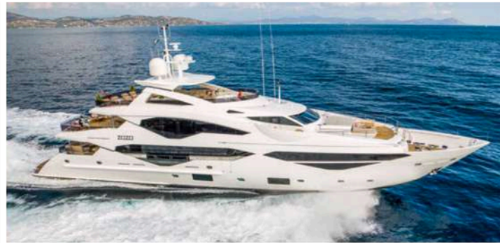
Sunseeker 131: the UK builder’s booth is located directly in front of the Yacht Club de Monaco. These 40 metres do 25 knots.