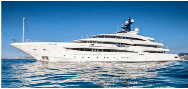
"Cloud 9": CRN is entering the Port on board these 74 metres. The massive yacht is the second largest in the builder's history.