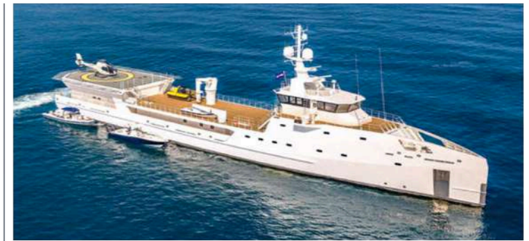
"Game Changer": Amels again presents a supply vessel. These 69 metres feature 250 sqm of deck space and a 12t crane.

CRN's 74-metre "Cloud 9" (designed by Zuccon/Winch). Representing Italy are Benetti's 67-metre "Seasense" with her giant pool, 52-metre "Seven Sins" and Tankoa's 50-metre "Vertige". Those that like their yachts a little more compact will find what they're looking for at Sunseeker (116 and 131), Princess, Gulf Craft (Majesty 100) or Azimut (27m + 35m). Visitors can also look forward to the debut of the Drettmann explorer