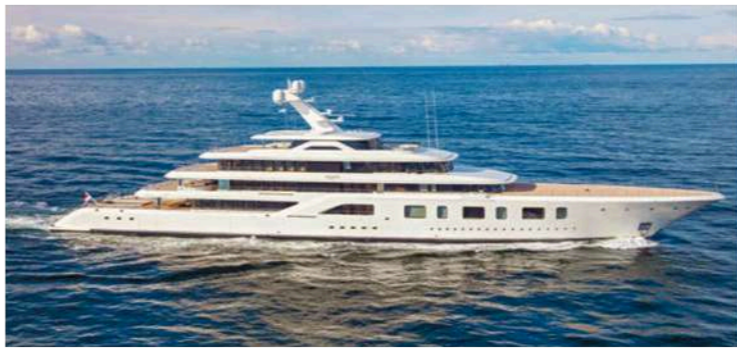
"Aquarius": 92 elegant Feadship metres with a large foredeck and exterior plus interior styling by Sinot Yacht Design.