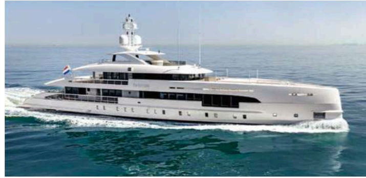
“Home”: Heesen is exhibiting 50 innovative metres with an FDHF hull and hybrid propulsion. She has Omega Architects styling.