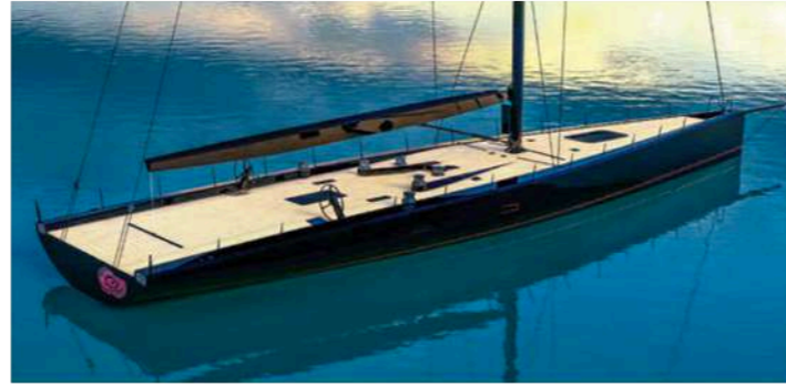
“Tango”: Wally is docking this 30-metre sloop with a Pininfarina interior just for a day. She’s then off to St. Tropez for the regatta.