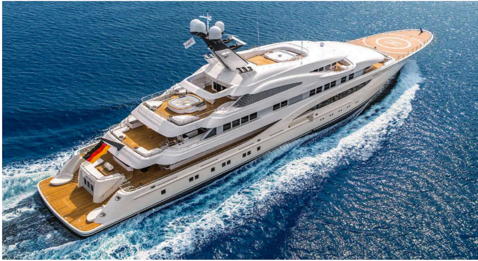
"Areti": Lürssen built this Winch design in Rendsburg and delivered her in July to her owner. What used to be known as Project "Sasha" is Passenger Yacht Code-certified and permitted to carry more than 12 guests. A large spa facility is located in her stern.