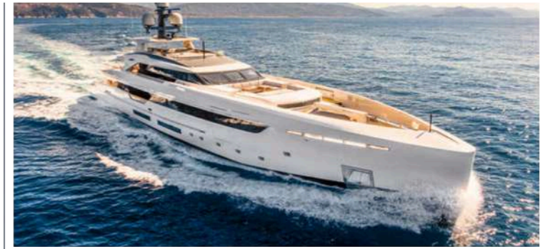
"Vertige": Genoa-based Tankoa is showcasing its second delivery to date – 50 metres featuring a Paszkowski design.