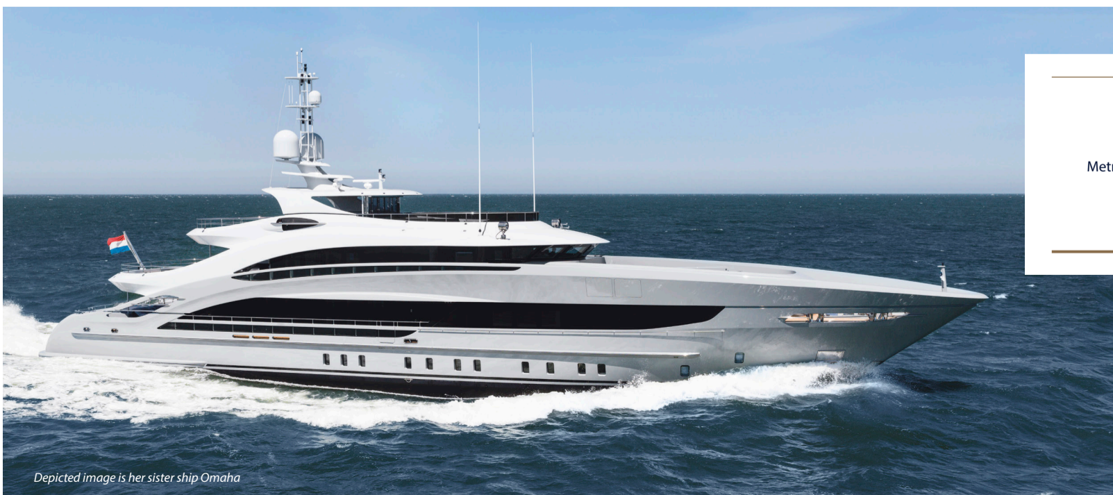
Depicted image is her sister ship Omaha

Displacement 50m Steel Metres 50 | Knots 15 | Ready 2020 heesenyachts.com