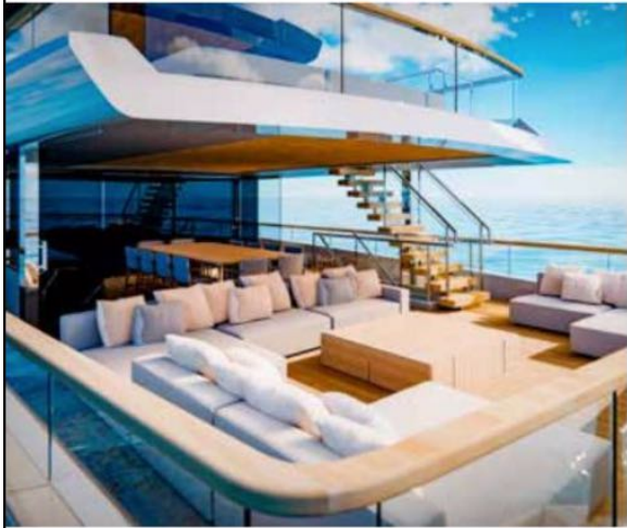
Above, the open-air upper deck lounge is like a large terrace with elegant furnishings with a strong maritime appeal and few frills. Right, the sundeck with sunpad, sheltered dining area, a bar forward with sofas and a dayhead