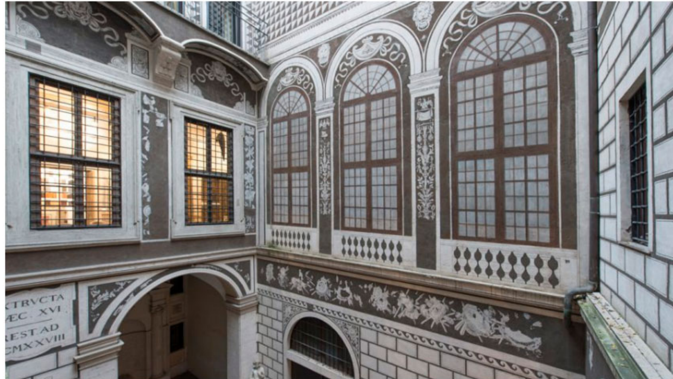
Exclusiva headquarters in Rome